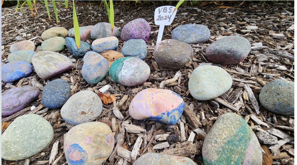
Prayer stones in our garden from Vacation Bible School 2024