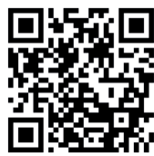
St. Michael the Archangel