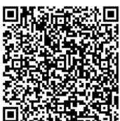
St. Jude the Apostle

Your generosity supports the mission of Saint Jude the Apostle and Saint Michael the Archangel, helping us to worship, serve others, and grow as disciples of Jesus Christ. For those who prefer to give electronically, QR codes for both parishes are available in the bulletin each week. Thank you for your faithful support and for being part of what God is doing in our parish communities.