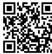
St. Michael the Archangel