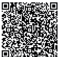
St. Jude the Apostle

Thank you for your faithful support and for being part of what God is doing in our parish communities—especially during this Easter season.