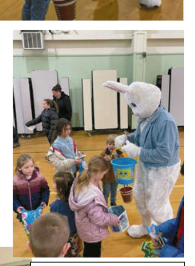
Faith Formation students and St. Jude the Apostle School students, enjoyed a morning with Peter Cottontail.

Thank you to everyone who donated goodies for this wonderful event.