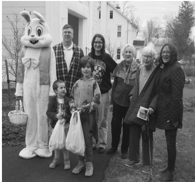
"Hopper" the Easter Bunny visits the children and young at heart.

Our Church is alive with flowers, colors, aromas, and Easter faith during these 50 Days of Resurrection. Our music and song gather, inspire, and uplift. Each week we exclaim "Glory to God", singing of a new Creation. Our response to the Acts of the Apostles (our first reading during Easter) is Psalm 118 "Sing to the mountains, sing to the sea, Raise your voices, lift your hearts. This is the day the Lord has made. Let all the earth rejoice. "We approach the Gospel with the exuberant Caribbean "Alleluia. Jesus is the way the truth, the truth, the life. We renew our faith in a resounding "I do to" to the Creedal questions. When we gather around the Lord's Table we sing of our mystery: "Save us, Savior of the Lord, for by your Cross and Resurrection you have set us free. "We are sent forth with an Alleluia in our heart witnessing to the unconditional love of God.