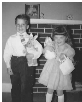
Easter Mass... a long time ago...yet timeless

Get active in something; be creative. Smile at Mass; sing and actively participate. Help out at our Food Pantry; buy soup to share. Come to Mass at Kingsway Nursing Facility. Bring cookies to our parish hospitality. Be kind; write a note; volunteer; vote; call someone who is ill; praise a kid; change a negative in your life; do something positive; cry with someone; laugh and enjoy life; smile!