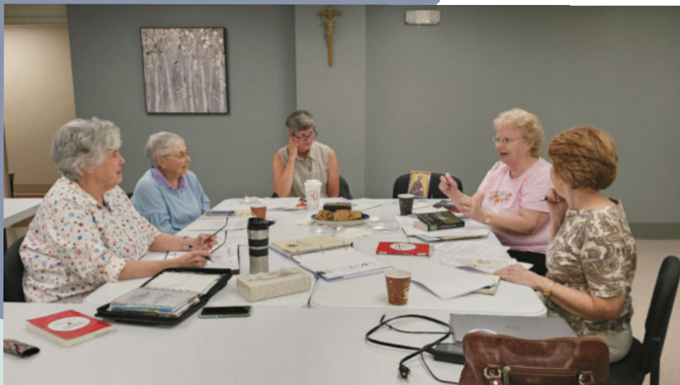
Some of the many members of the Ignatian Volunteer Group enjoying themselves during their planning meeting.

If you are in need of a prayer shawl, they are available in the parish office during office hours. They are lovingly made by our Prayer Shawl Ministry and represent a way to share God's love and compassion to those in need of comfort and solace.