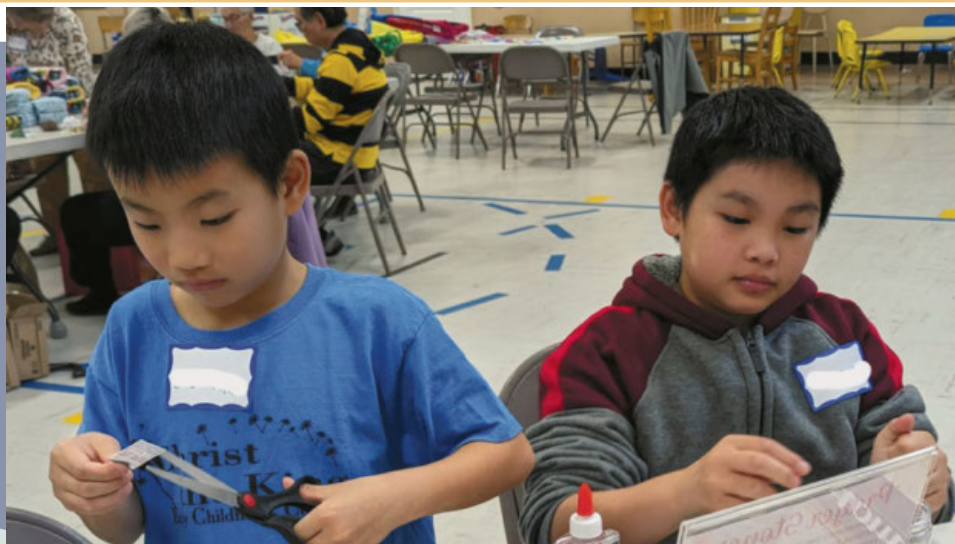
Young parishioners participating in Service Week!