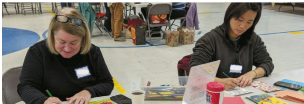
Parishioners participating in our Service Week Finale Day