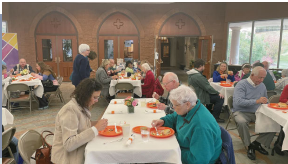
Anointing Service Luncheon