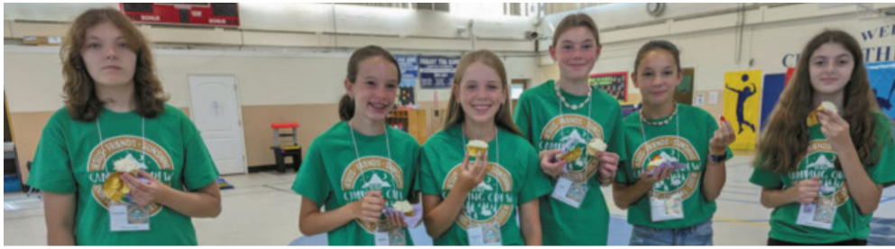
Teen VBS leaders enjoying snack