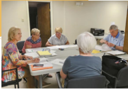
Some of our Visitation Ministry members